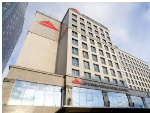
Austria Trend Hotel Ljubljana

The Austria Trend Hotel Ljubljana is located only a few minutes from the city centre of Ljubljana. The main attractions and the city centre of Ljubljana can easily be reached by public transport. The Old Town, the Convention Centre, the Faculty of Economics, the BTC shopping centre, the Kravavec skiing resort, several golf courses and Center Stozice are situated in the vicinity of the hotel as well.